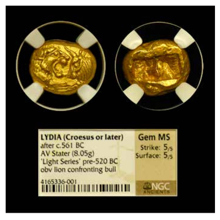
This is without question one of the finest known examples of the first gold coin ever produced, the Lydian Gold Stater issued by King Croesus. Nearly 2,600 years old, it now resides in a private collection in Austin.

Today, this rich history can be seen in the magnificent designs on ancient coinage. You see, coins were not only used as currency, but as a way for rulers to proclaim their influence to the far ends of the empire. This concept still applies to our coinage today.